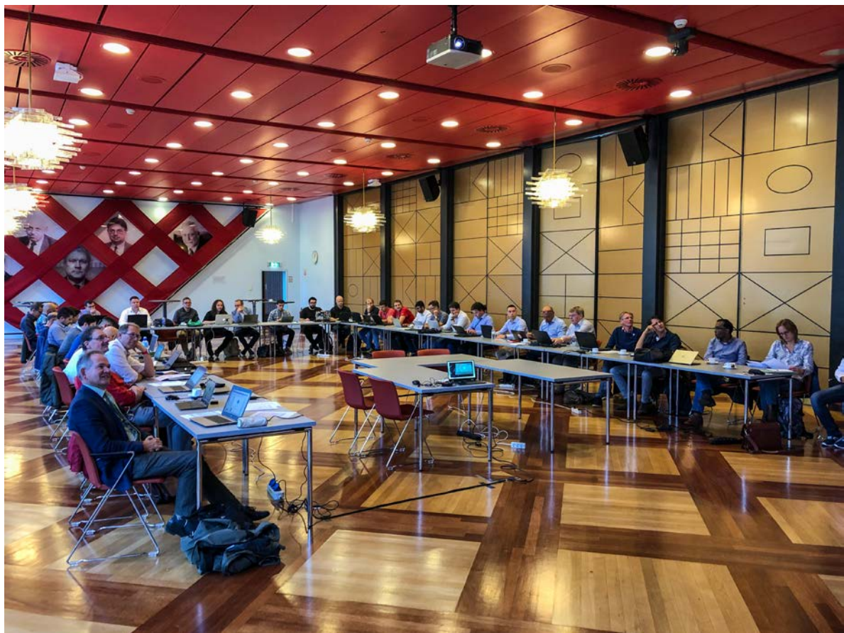
Figure 3: Attendees to the first FitOptiVis End User Workshop